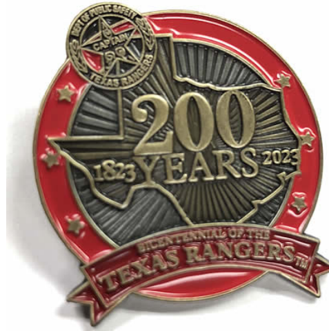
Official Texas Rangers Bicentennial Pin

Please click here to learn more about the program.