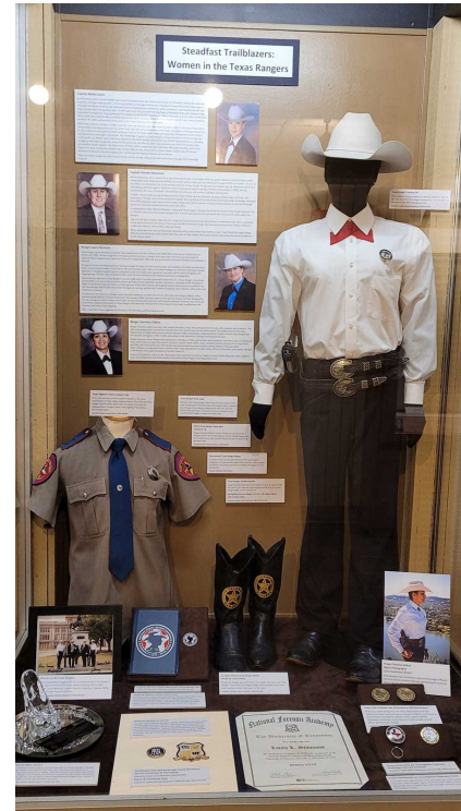
Right: "Steadfast Trailblazers: Women in the Texas Rangers" can be found in Taub Hall.