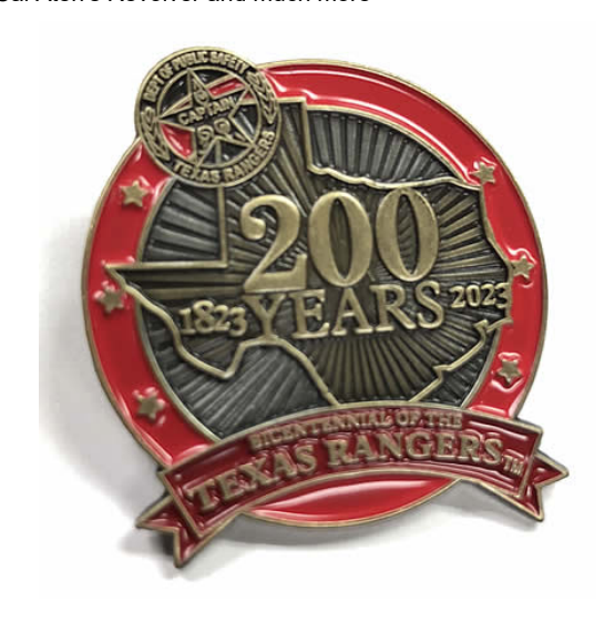
Official Texas Rangers Bicentennial Pin

Please <u>click here</u> to learn more about the program.