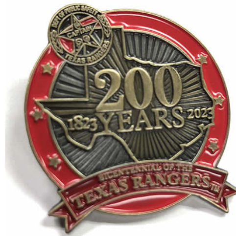
Official Texas Rangers Bicentennial Pin

Please click here to learn more about the program.