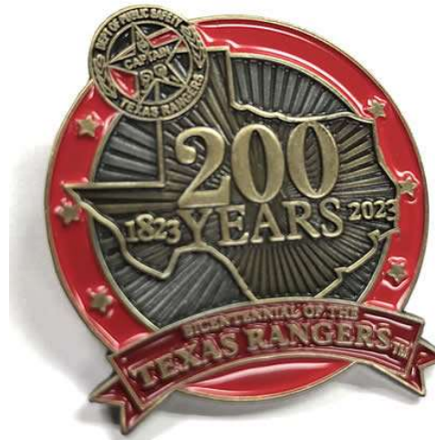
Official Texas Rangers Bicentennial Pin

Please click here to learn more about the program.