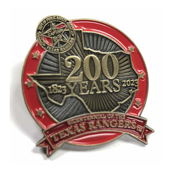
Official Texas Rangers Bicentennial Pin

Please <u>click here</u> to learn more about the program.