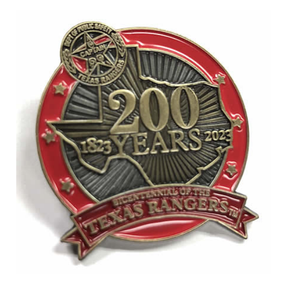
Official Texas Rangers Bicentennial Pin

Please <u>click here</u> to learn more about the program.