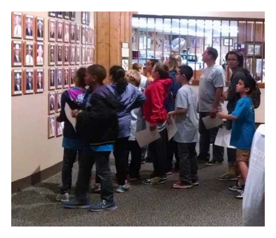
Schoolchildren in awe of the active-duty Texas Ranger wall.

Roster of Living Retired Texas Rangers - Upon retirement, those Texas Rangers wishing to do so complete a survey of their career in law enforcement, including service as peace officers, deputy sheriffs and more. These biographies are uploaded to the Distinguished Service roster online and exhibited in the Hall of Fame with rotating artifacts from retirees. Please click here to search the database.