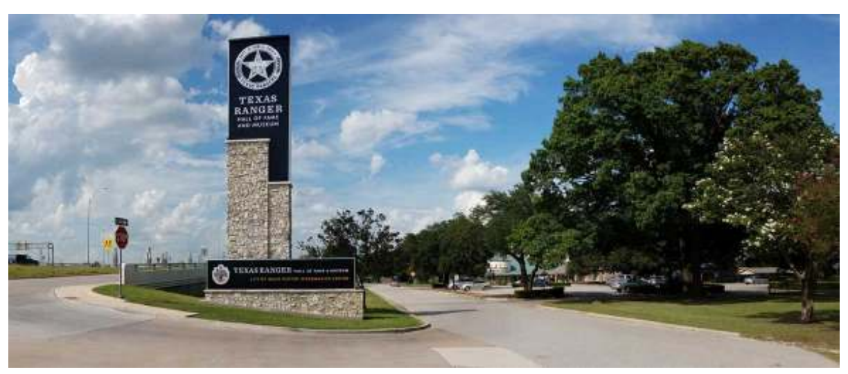
May 14, 2020