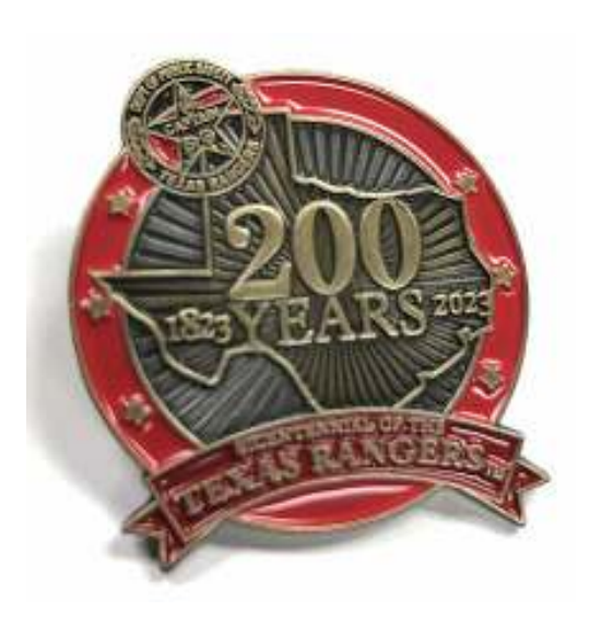
Official Texas Rangers Bicentennial Pin

Please <u>click here</u> to learn more about the program.