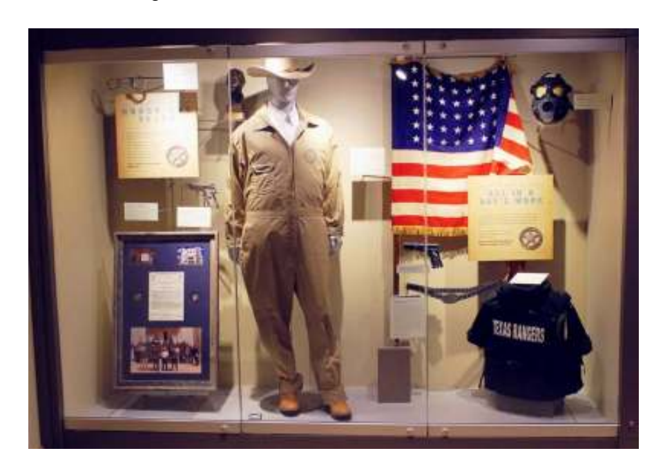
A rotating exhibit, Distinguished Service highlights items from retired Texas Rangers.

Roster of Living Retired Texas Rangers - Upon retirement, those Texas Rangers wishing to do so complete a survey of their career in law enforcement, including service as peace officers, deputy sheriffs and more. These biographies are uploaded to the Distinguished Service roster online and exhibited in the Hall of Fame with rotating artifacts from retirees. Please click here to search the database.