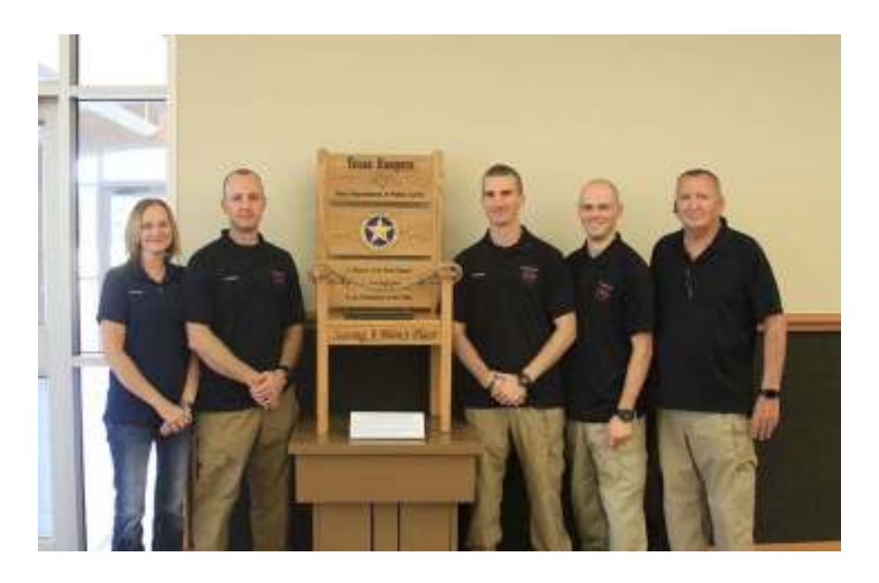
Saving a Hero's Place donated an Honor Chair memorializing all fallen Texas Rangers since 1823 for display in the Hall of Fame in 2015.

• Roster of Those Killed/Died in the Line of Duty - The Texas Ranger Hall of Fame and Museum staff estimates that fewer than 1% of the individuals who have served as Texas Rangers were killed or died in the line of duty. A Ranger is considered to have been killed in action, KIA, if they were killed while attempting to enforce the laws of the state. A Ranger is considered to have died in service, DIS, if the death was a result of illness, accident, or some other means not associated with one's duties. Please click here to see the list.