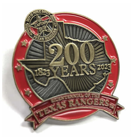
Official Texas Rangers Bicentennial Pin

$90 of the contribution qualifies as a charitable contribution. The Texas Ranger