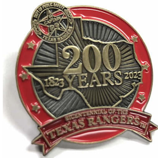
Official Texas Rangers Bicentennial Pin Trademarked by the Texas Dept. of Public Safety Designed by the Texas Ranger Hall of Fame and Museum

Please click here to learn more about the program.