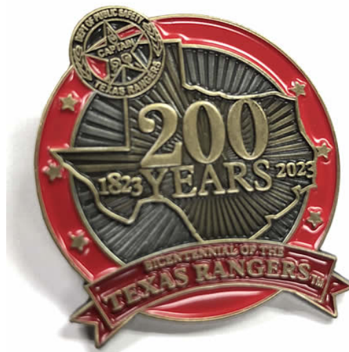
Official Texas Rangers Bicentennial Pin Trademarked by the Texas Dept. of Public Safety Designed by the Texas Ranger Hall of Fame and Museum

Please click here to learn more about the program.