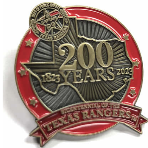
Official Texas Rangers Bicentennial Pin Trademarked by the Texas Dept. of Public Safety Designed by the Texas Ranger Hall of Fame and Museum

Please click here to learn more about the program.