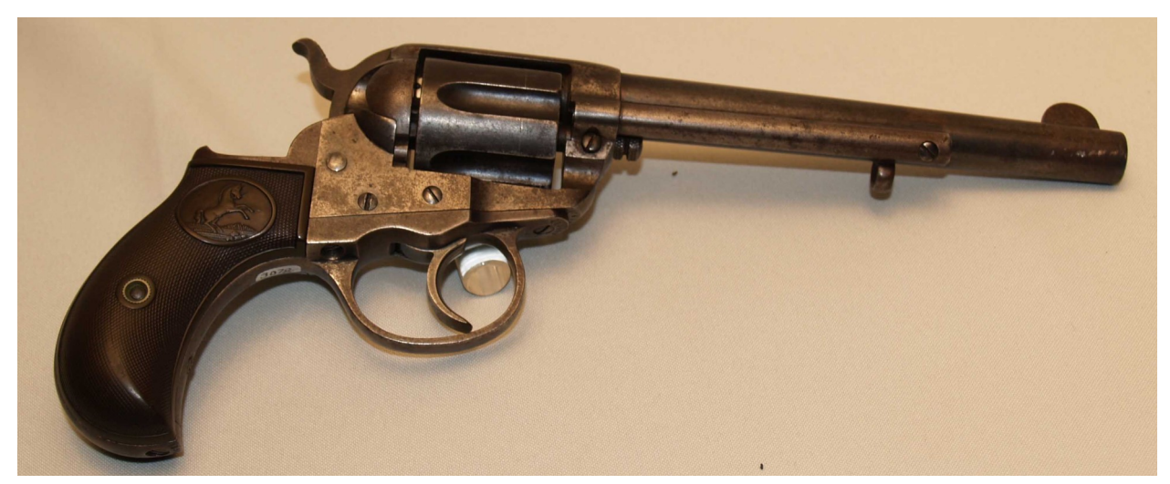
Model 1877 Thunderer, Cat. No. 3078

Although production of this firearm continued into the 20<sup>th</sup> century, it was never adapted to smokeless powder. A warning against the use of smokeless powder was made with guns shipped from 1898 to 1909.