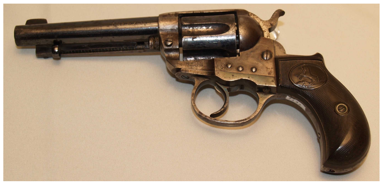
Model 1877 Lightning, Cat. No. 3232