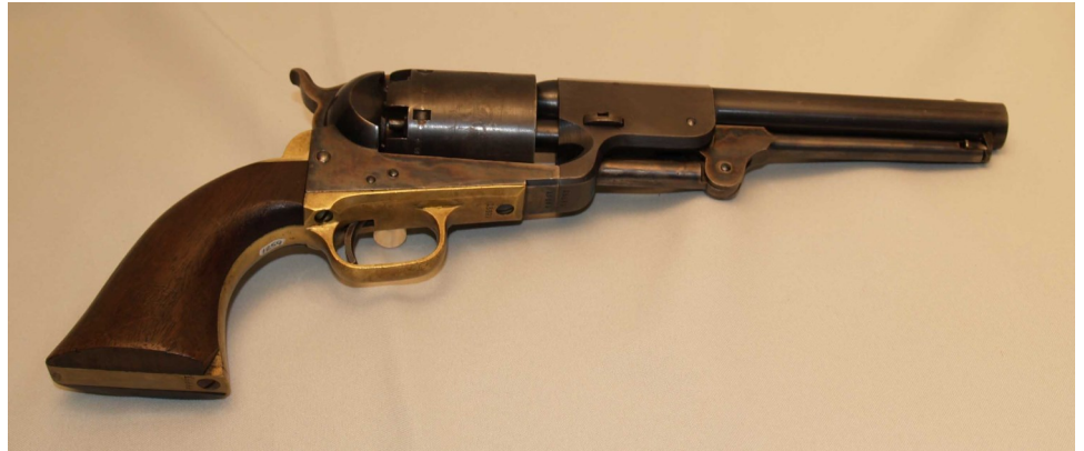
Third Model Dragoon revolver, Cat. No. 1259

The Third Model was the final design of the Dragoon revolver series. It also offered detachable shoulder stocks which are now