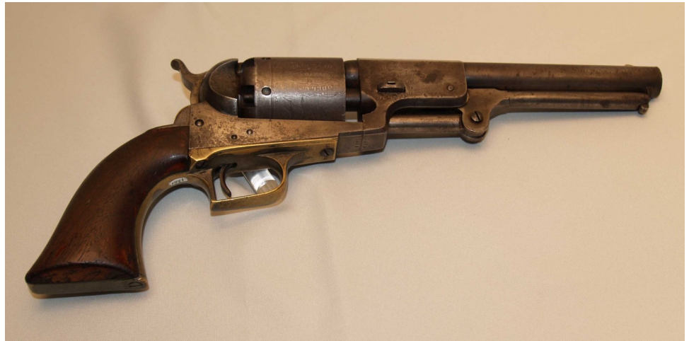
First Model Dragoon revolver, Cat. No. 1261

The First Model Dragoon revolver was the best available at the time and became popular with both the military and civilians in the American West.