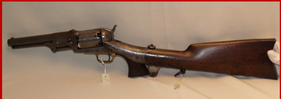
Third Model Dragoon revolver with detachable stock, Cat. No. 1233a&b

Three detachable shoulder stock designs were available, including the military design option of a water canteen inside.