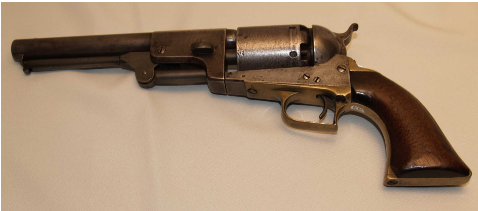
Second Model Dragoon revolver, Cat. No. 2076

The Second Model Dragoon looked very similar to the first, but included improvements that continued to make it popular with the military and civilians.