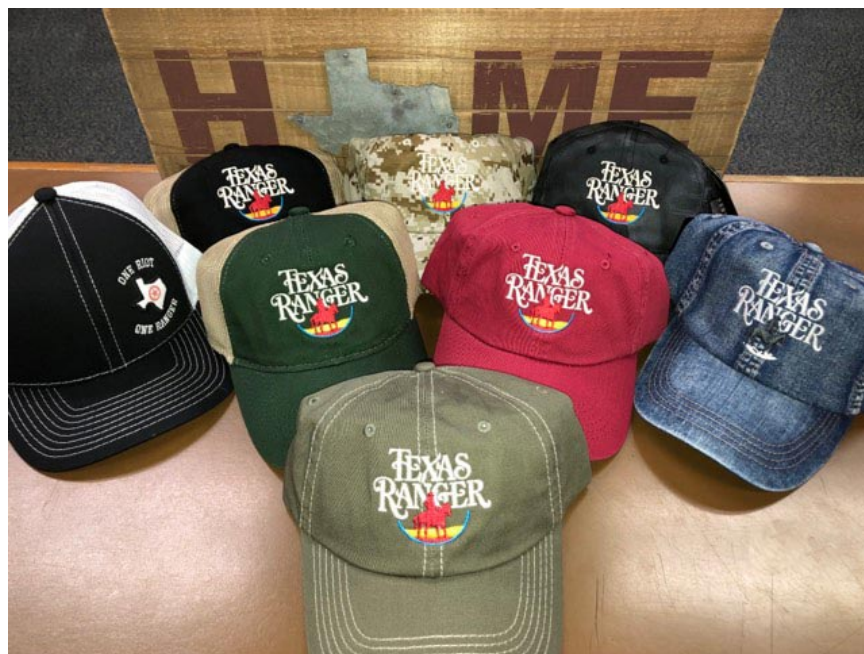
A selection of the baseball hats at the TRHFM Store

To shop more items available for purchase, please visit our Gift Shop online , or in person 9am to 4:30pm daily. You never have to pay admission to shop.