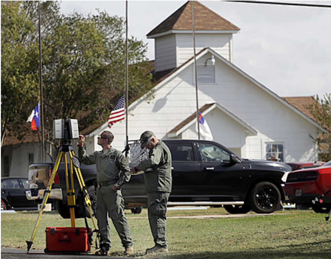
Texas Rangers utilize a Leica scanner following the Sutherland Springs Church shooting in 2017.

the Sutherland Springs Church shooting in 2017, and the Austin bombings in 2018 among many others.