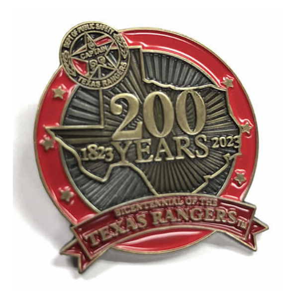
Official Texas Rangers Bicentennial Pin Trademarked by the Texas Dept. of Public Safety Designed by the Texas Ranger Hall of Fame and Museum

Please <u>click here</u> to learn more about the program.