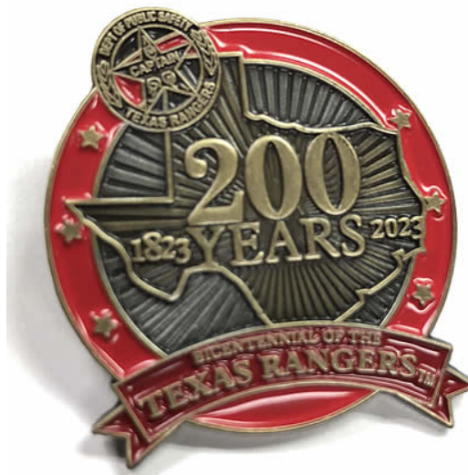
Official Texas Rangers Bicentennial Pin Trademarked by the Texas Dept. of Public Safety Designed by the Texas Ranger Hall of Fame and Museum

*Corporate and Foundation Supporters: Please call us toll-free at 1-877-750-8631 to discuss how your company or foundation can participate on the company and foundation level.