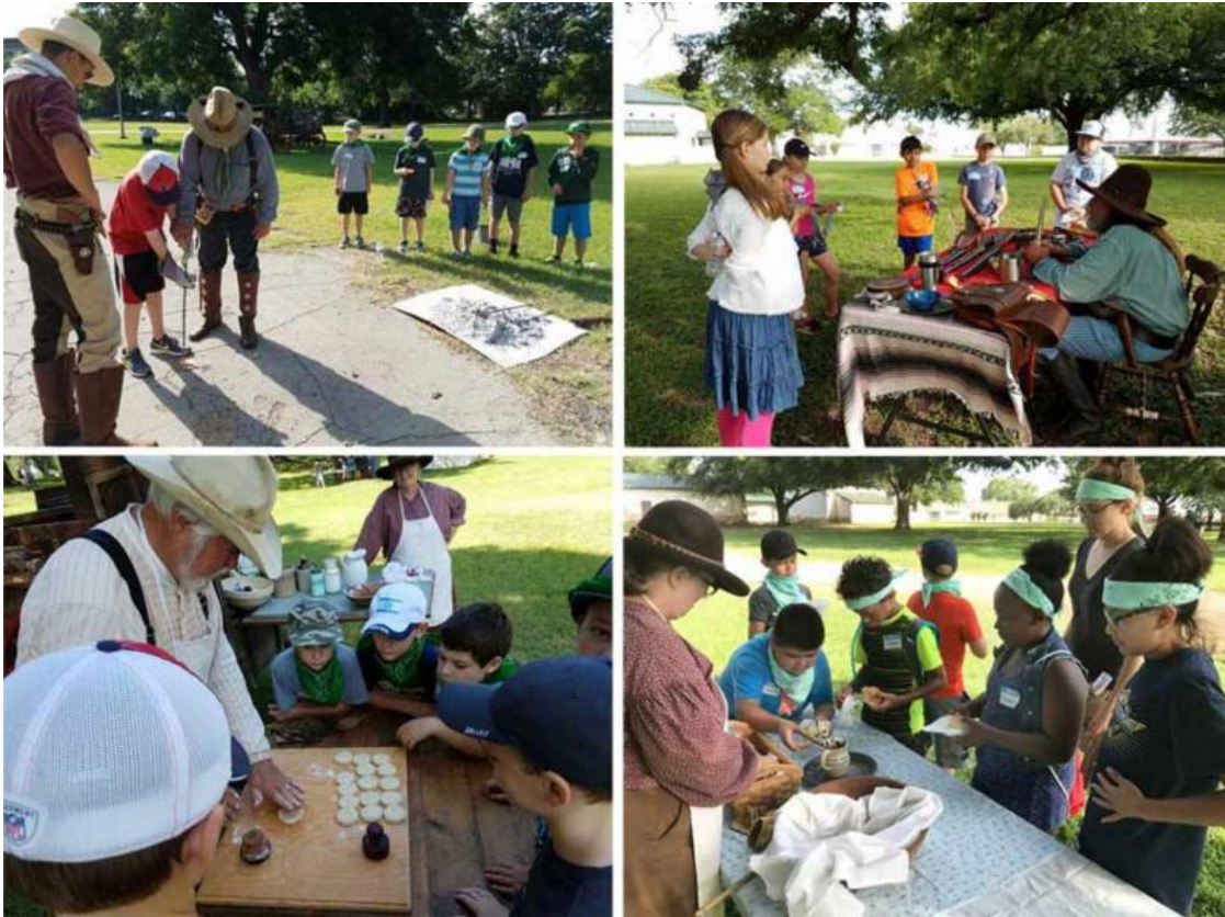
Top left to right: Campers make branding symbols using warmed metal brands; campers learn about tools of the 19th Century Ranger from scopes to coins and saddle bags. Bottom left to right: Campers cut out biscuits out of dough for cooking; campers eat cooked biscuits topped with bootstrap molasses.