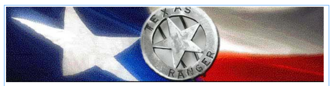
Texas Ranger Hall of Fame and Museum

Having trouble viewing this email? Click here