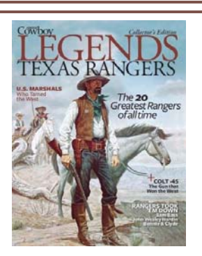
On Newsstands 10/7

Due to the time required to maintain the center and schedule events, we have instituted an application fee. This fee will help maintain and fund TRHFM educational programs, such as Spring Break Round Up and Summer Camp. We appreciate your understanding and continued support of our outreach efforts. Thank you.