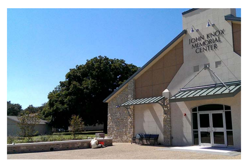
Workers add the finishing touches to the Knox Center planters.

To book Knox Center, visit our banquet website or contact Mika Coffey at (254) 750-8631.