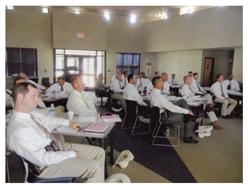
During the week of August 6th, over 20 new Texas Rangers participated in a weeklong training session in the Texas Ranger Education Center.

To learn more about the Texas Ranger Education Center, visit our website or contact us at (254) 750-8631.