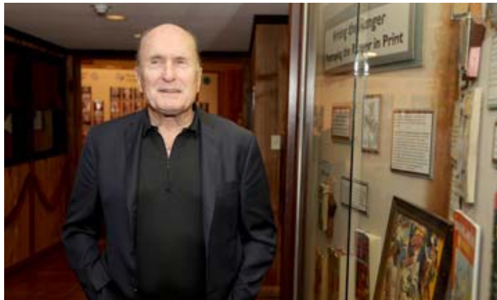
Mr. Duvall tours the museum, including the pop culture gallery.