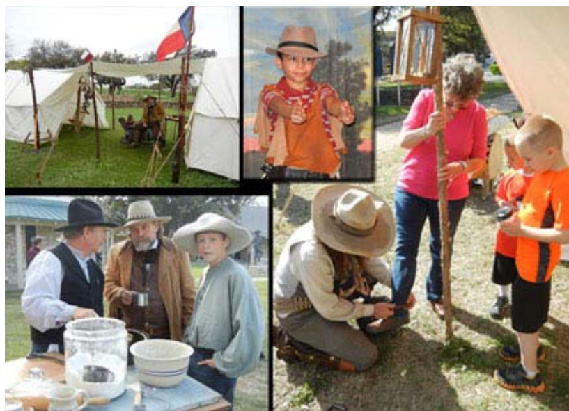
Photographs from Spring Break Round Up 2013.

On Saturday, March 14th from 10:00 am to 2:00 pm, the Texas Ranger Hall of Fame and Museum will host its annual Spring Break Round Up event. The come and go event will feature activities and programs for children and adults.