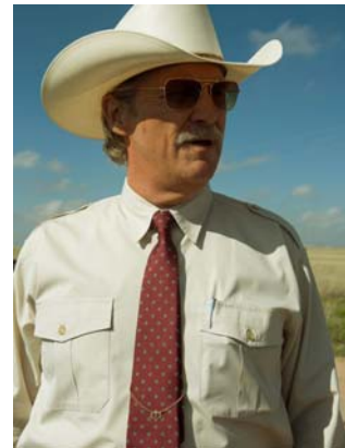
Photo: Jeff Bridges in Hell or High Water