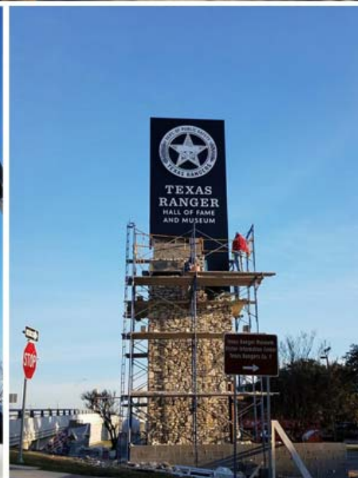
Top: Monument sign on truck bed being delivered to the site. Middle Left: Large cranes are used to place monument on the center support rod. It is then welded into place. Middle Right: Limestone is wrapped around the cinder block center to complete the monument. Below Left: Ground level monument is placed on cinder block core and wrapped with limestone. Below Right: Finishing the monument with silver aluminum edging.