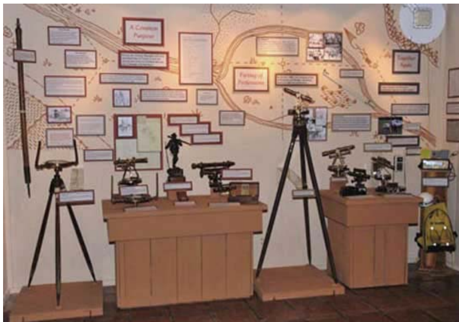
Before the Renovation