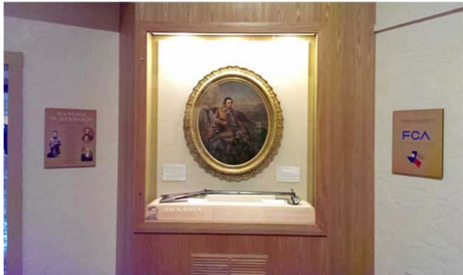
After the Renovation

Support for the new exhibits was made possible by the generous donations from Ram and the Fiat-Chrysler Automobiles Foundation and the Texas Society of Professional Surveyors.