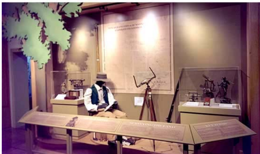
After the Renovation

A March opening reception for the exhibits is being planned and the public is welcome to attend. Please be on the lookout for more information in upcoming newsletters.