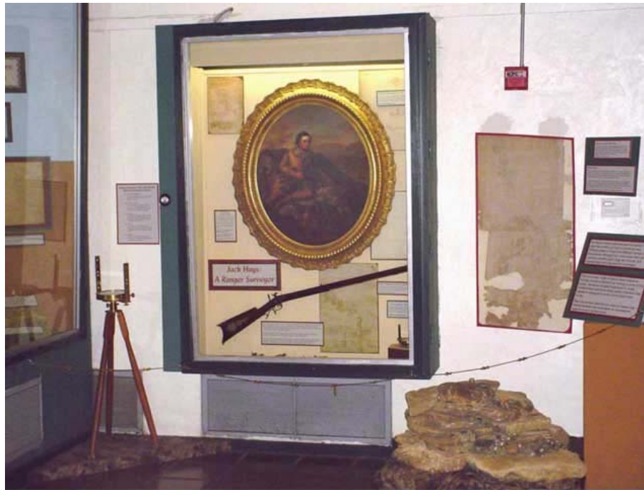
Before the Renovation