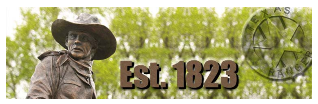
Texas Ranger Hall of Fame and Museum Email Newsletter Sponsored by the City of Waco

Having trouble viewing this email? Click here