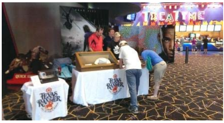
Movie patrons visit the TRHFM booth at Regal Jewel 16.

Now Available! Get your Lone Ranger and Tonto gear in the Museum Gift Shop. Items available include action figures, clothing, jewelry and a puzzle game. Call toll free (877) 750-8631 for more information. Browse our <u>online catalog</u> to view other great merchandise!