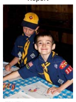
TRHFM was happy to assist the following nonprofits and state agencies this quarter:

Association of Fundraising Professionals, Communities in Schools, Daughters of the Republic of Texas, Family Health Center, Girl Scouts, Heart of Texas Autism Network, Historic Waco Foundation, Mission Waco, National Alliance on Mental Illness, Susan G. Komen for the Cure, Texas AHEC, Texas Department of Assistive and Rehabilitative Services, and the Texas Department of Public Safety.