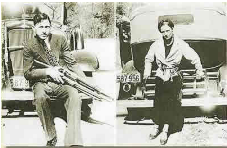
Criminals Clyde Barrow and Bonniue Parker.