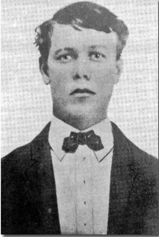
Sam Bass, train robber and outlaw