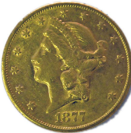
$20 gold piece from Sam Bass train robbery now in the Texas Ranger Research Center in Waco.

time his luck had run out, and the crimes brought as little as $11 and also attracted the unwelcome attention of the Texas Rangers. As the net around him grew tighter, Bass planned to enter Mexico or South America and make his escape, to be financed by a string of Texas bank robberies.