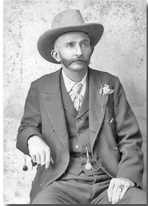
Captain Bill McDonald, legendary Texas Ranger