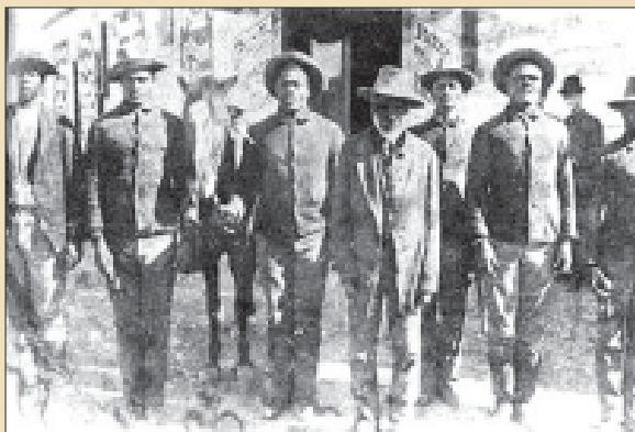
Seminole Negro Indian Scouts