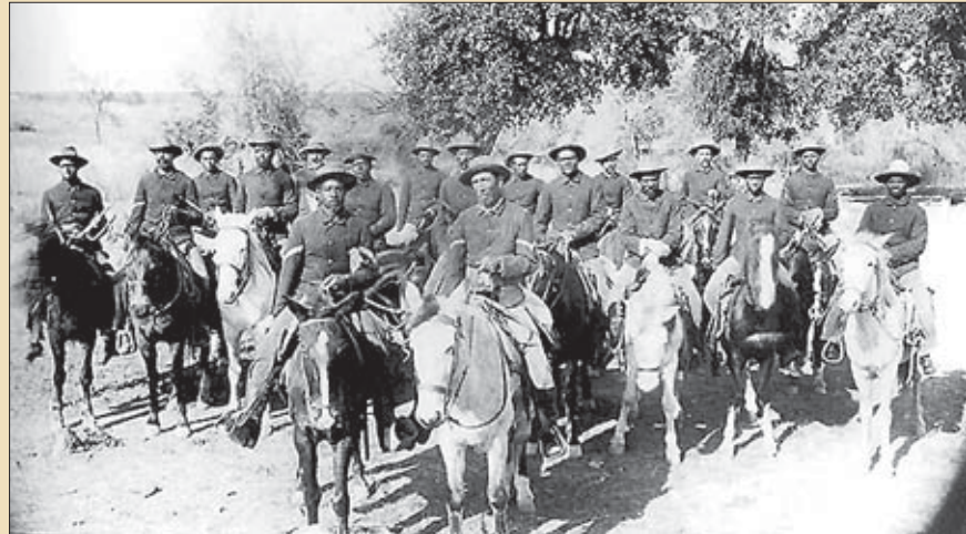
Black Seminole scouts

The Black Seminoles joined with the Seminoles as soldiers against the United States in the Second Seminole War (1835-1842). Their involvement proved instrumental in the longevity of the conflict. At one time, US Army General Philip Jessup said that the Second Seminole War was “against the Negro, not the Seminole Indians.” Many former slaves fought alongside the Seminoles in wars against the United States.