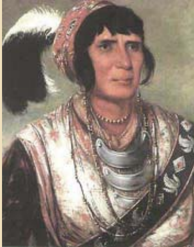
Osceola , Seminole leader in Florida, where he died. Therefore, he did not go to the Indian Territory.

By the 18th century, Muscogulge culture had evolved into a blend of Indian, European, and African customs. While it is impossible to assign percentages to the principal Muscogulge racial mixture, all of these cultures were represented as integral parts of the Creeks and Seminoles. As an example, observe Southwestern culture, which has developed into an admixture of European (white), Mexican (Spanish), and Indian ways of life. When cultures interact, there is often an exchange of some traits between the participants.