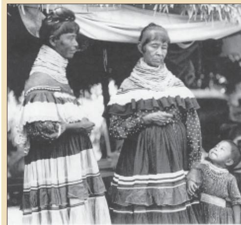
Black Seminole Maroon women

As reported in some historical data, the relationship between Blacks and Seminole Indians suggests the Seminoles, in the estimation of whites, practiced a modified form of slavery. Maroons essentially lived in their own villages, farmed their own crops, controlled most aspects of their existence, owned property, possessed weapons, and had their own leaders.