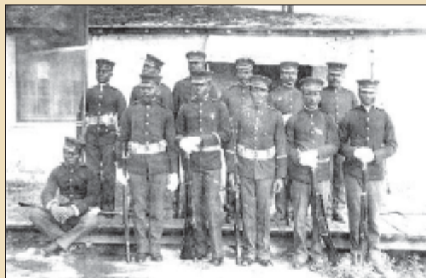
Group of scouts in 1910.