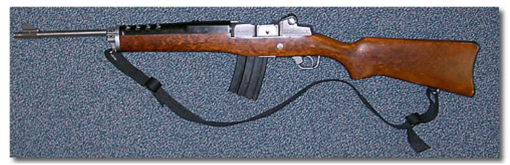
The Ruger Mini-14 .223 served the Rangers for more than 20 years.

For more than twenty years, the Department of Public Safety has issued Ruger Mini-14 rifles to our law enforcement officers. Using funds from drug seizures, a total of 3,008 M4 rifles have been purchased for use throughout the Texas DPS. Effective as they are, some age-related problems have begun to surface after twenty years.