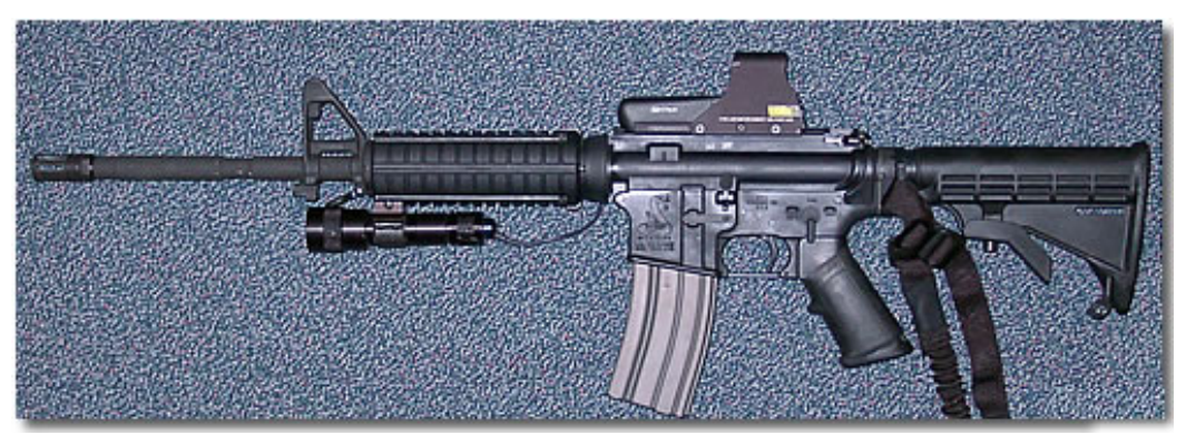
Bushmaster M4 .223 equipped with an EOTech holographic sighting system and a SureFire tactical flashlight with pressure switch.

The six-position, collapsible stock that comes standard on the M4 allows the weapon to be used as a long gun and a tactical weapon for close-quarters combat. The M4 also possesses dual iron sights. These can be changed in an instant, and they can allow precision accuracy at distances up to 400 meters. The same is true for their accuracy in the battle position for SWAT-type missions, where instant target acquisition is a must.