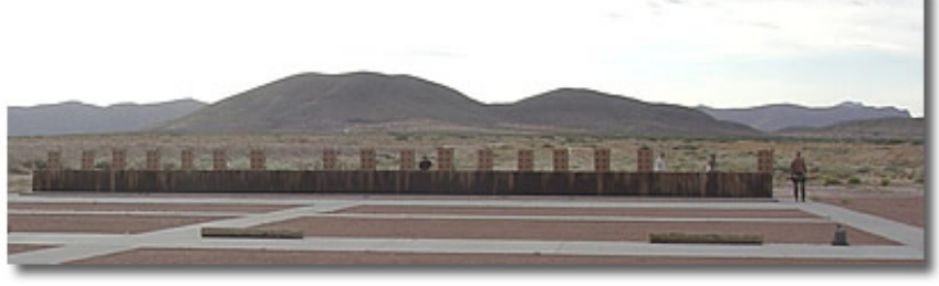
On the firing range at Fort Bliss, (El Paso) Texas.