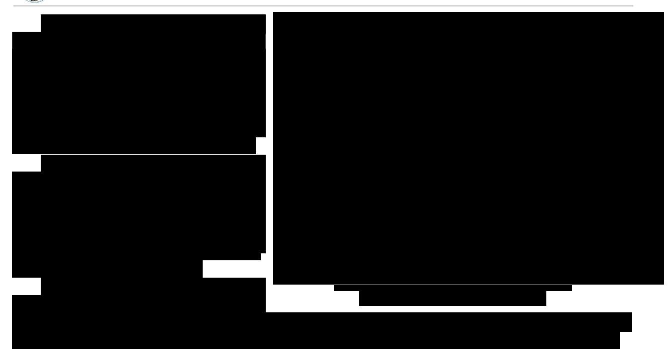
1 The Snyder Dailey News. March 29, 1953, 12.