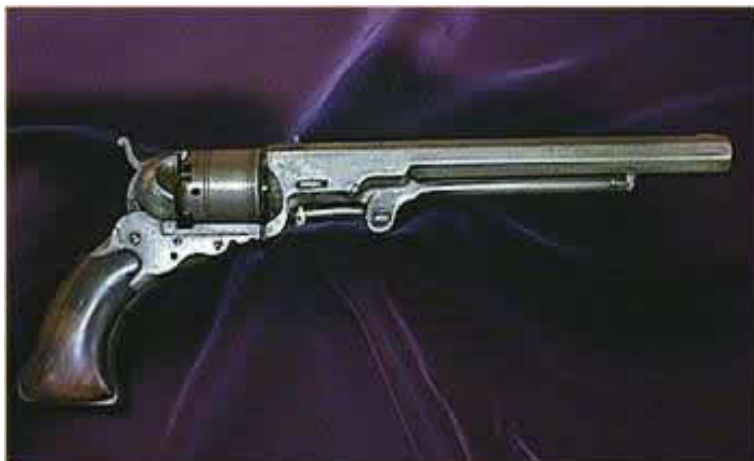
Colt "Texas" Paterson with later M1851 Loading Lever

Sam Colt was never satisfied with his latest revolver, regardless of the praise it produced and the acclaims it received. Even as the initial Patersons came off the production line in 1836, the inventor was seeking improvements.